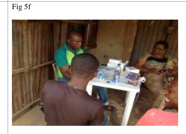
HTS Community Outreach