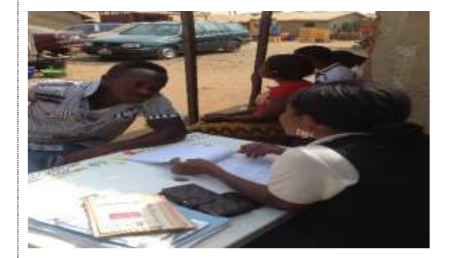
HTS Community Outreach