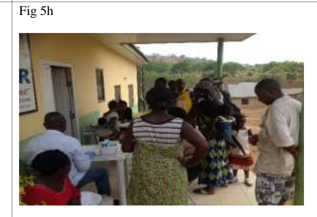
HTS Community outreach