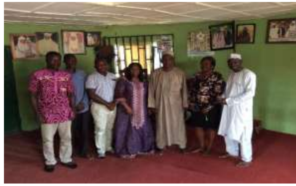
CHEDI staff on advocacy visit to Shere Koro (Mpape environ) Traditional Ruler