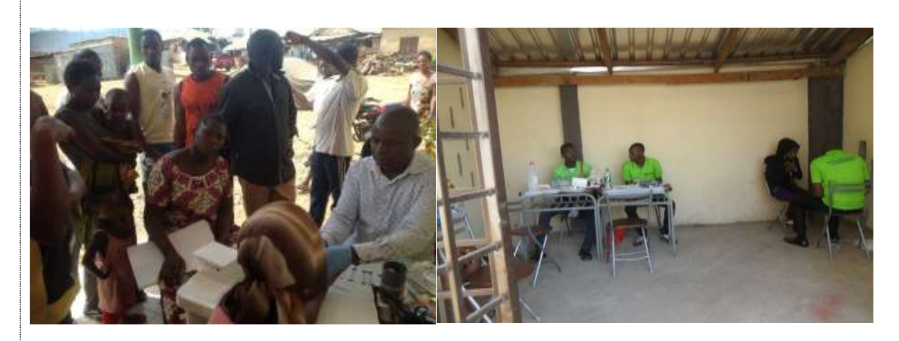
CHEDI staff and volunteers conducting community outreach on HIV, 2016