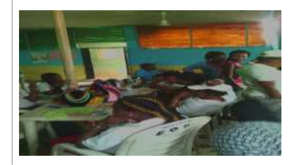
Skill Acquisition Consultant mentoring the FSWs in Bead Making Session