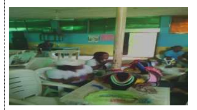
FSWs in the Bead Making Session