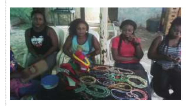
Finished Beads displayed by FSWs