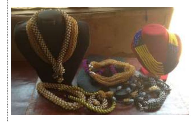
Displayed beads and Slippers produced by one of the FSWs (Lucy)