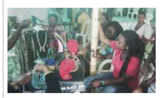
Skill Acquisition Consultant mentoring the FSWs in Bead Making Session