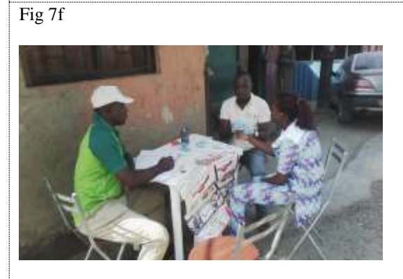
CHEDI staff conducting group counselling