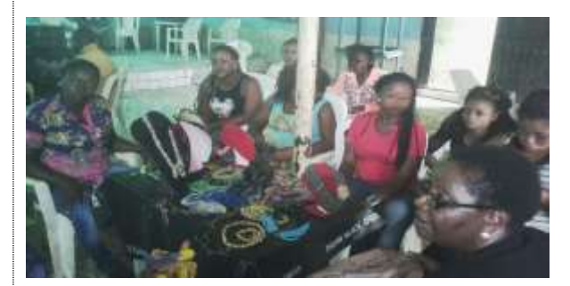
Finished Beads displayed by FSWs