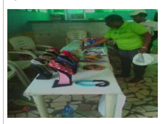
CHEDI executive director inspecting the exhibited household consumables and Beads on graduation day