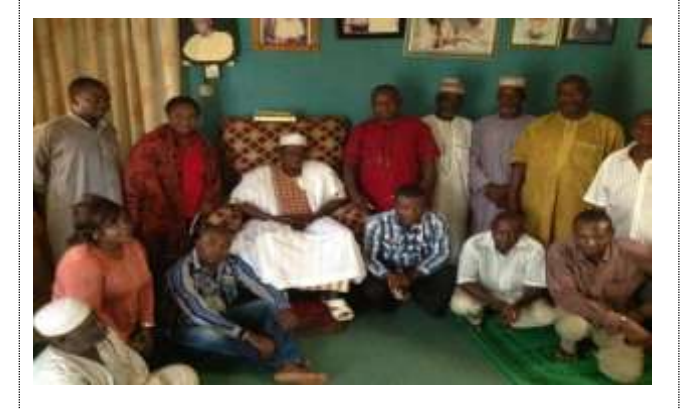
CHEDI staff on advocacy visit to Mpape Traditional Ruler