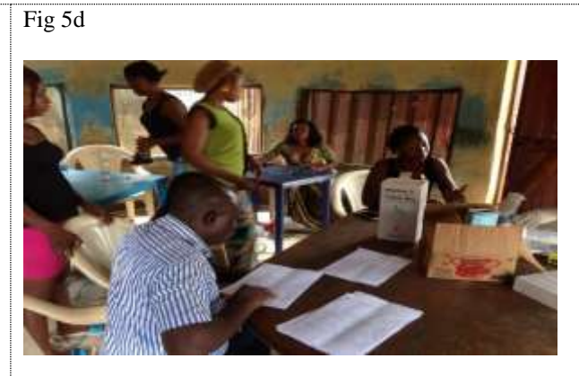
HTS Community Outreach in a brothel