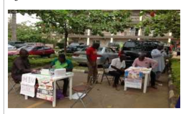
HTS Community Outreach