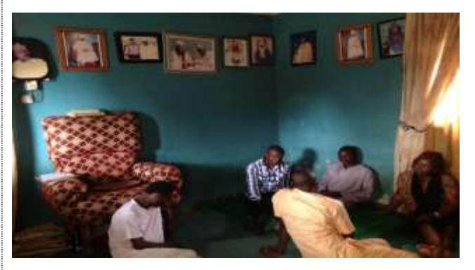
CHEDI staff on advocacy visit to Mpape Traditional Ruler