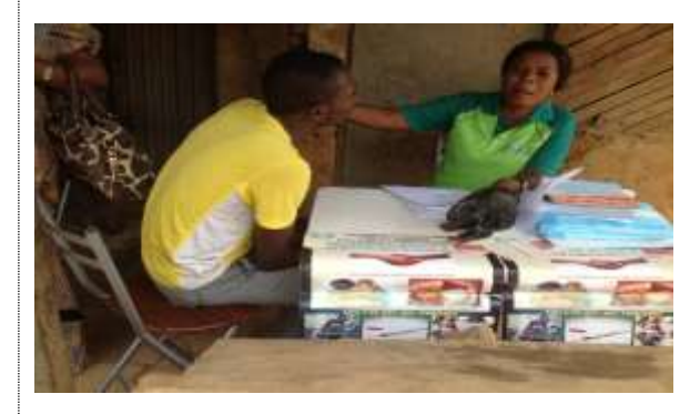
CHEDI staff conducting post counselling for a client