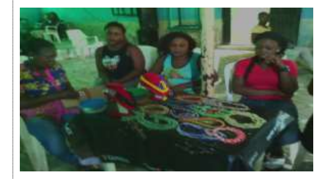
Finished Beads displayed by FSWs