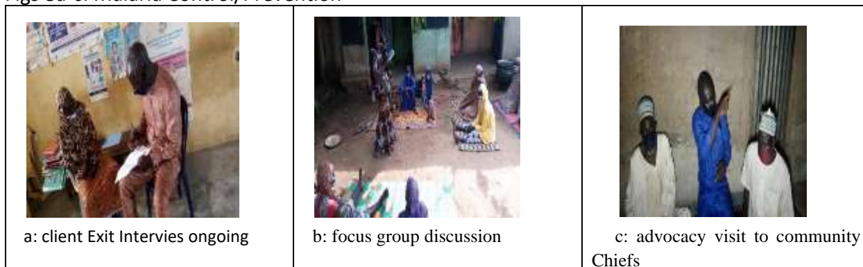
Figs 8a-c: Malaria Control/Prevention

CHEDI in Collaboration with ACOMIN implemented a 3-Year Global Fund Research on Malaria-Accountability and Advocacy Project in Lapai LGA, Niger State. The aim of the research was to identified issues and proffer solutions on the outcomes. In this research, we successfully monitored the supply of Long-Lasting Insecticide Treated Nets, ACT Drugs, SP for Pregnant mothers, consumption /usage in the following wards: Birni Maza, Doma, Gulu and Eboo (See figs: 8a-c).