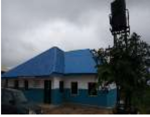
j newly installed borehole water tank