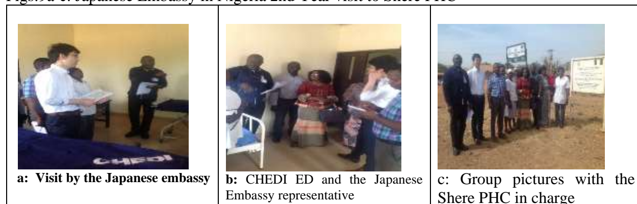
Figs:9a-c: Japanese Embassy in Nigeria 2nd Year visit to Shere PHC

Japanese Embassy in Nigeria 2nd Year monitoring was in January 2019 in company of Japanese embassy staff as stipulated in the contract agreement (see figs:9a-c).