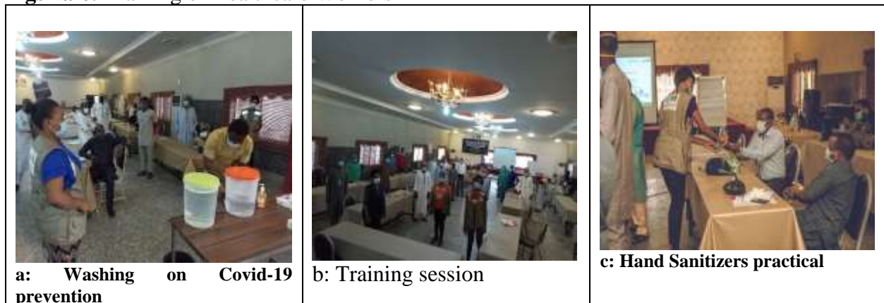
Figs 2a-c: Training of Healthcare Workers

CHEDI collaborated with NCDC in training Health Workers in FCT, Kano and Kwara States. The trainings built the capacity of Health Care Workers on Covid-19 Protocols following NCDC Guidelines. (See figs: 2a- c).