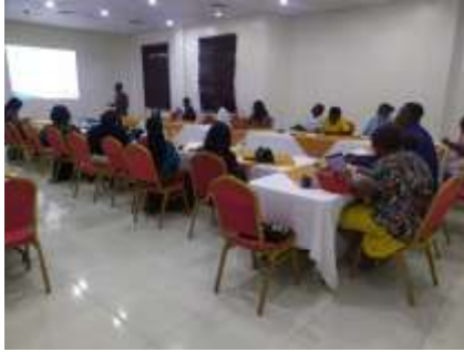
a: Group Session