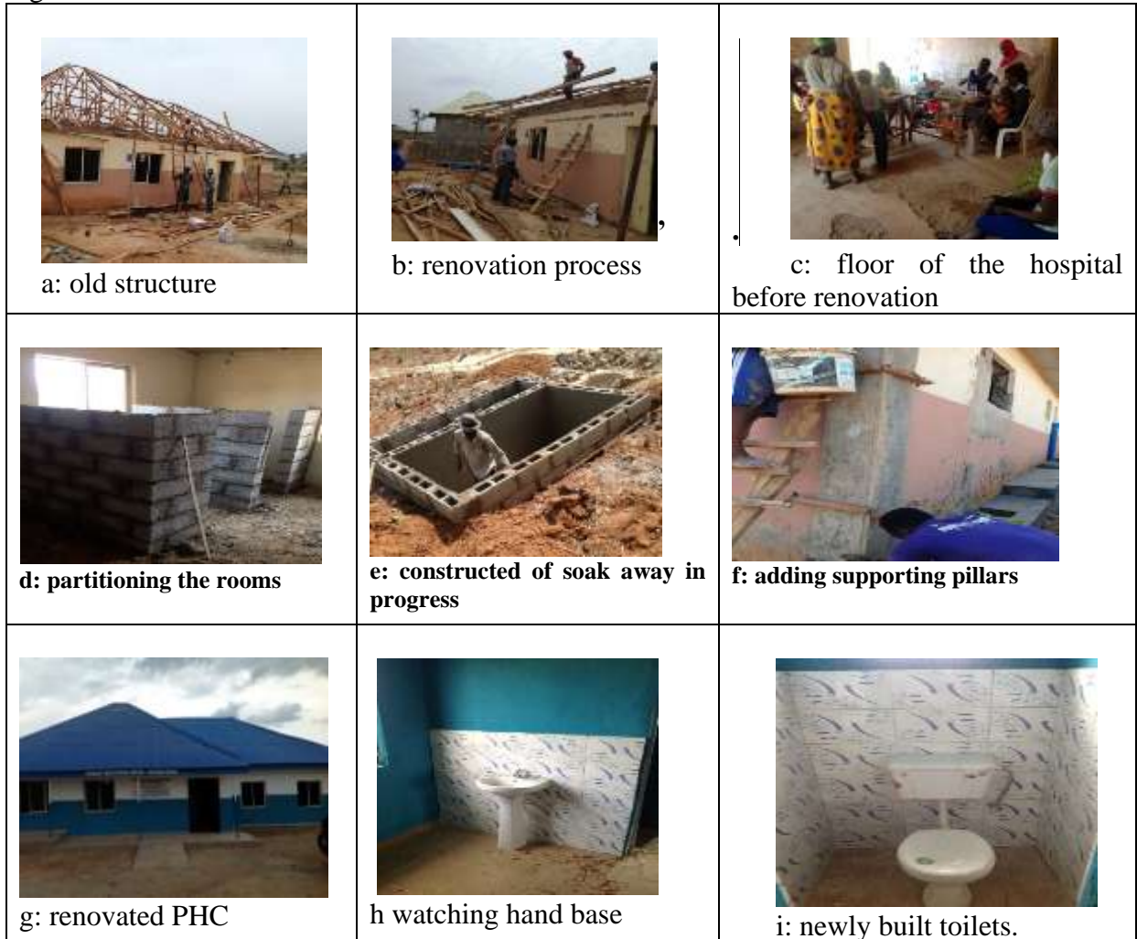
Fig4a- 4l: Renovation/Reconstruction of Kuchiko PHC

In collaboration with World Bank Staff, the FY2020 Community Connection Campaign we Renovated/Reconstructed Kuchiko PHC in of Bwari Area Council, Abuja. We drilled a borehole, installed Solar Light and purchased Generator for the PHC (Please, see figs: 4a –l). In addition, CHEDI donated Hospital Bedsheets and pillows for the facility.