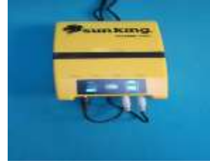
l: solar panel Component