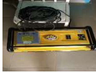
k: generator set