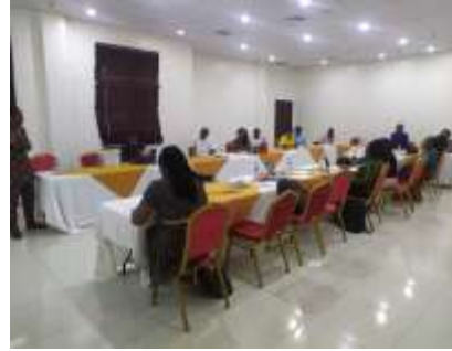
b: Brainstorming Session